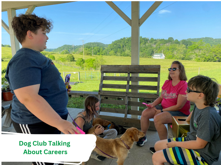
Dog Club Talking About Careers