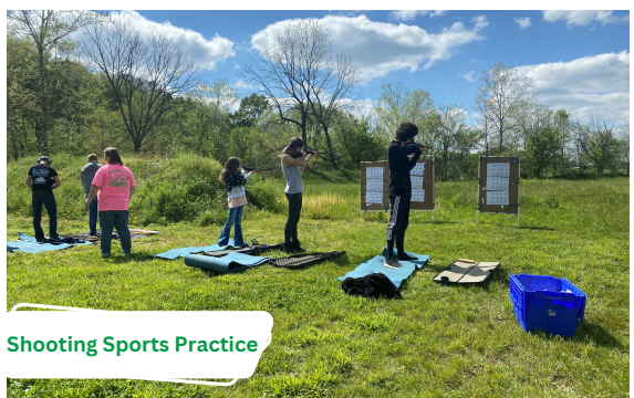
Shooting Sports Practice