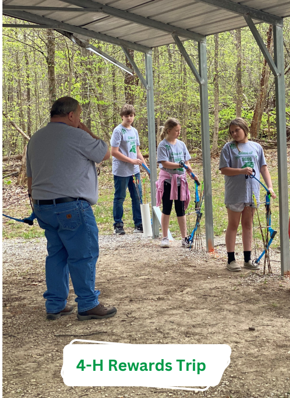
4-H Rewards Trip