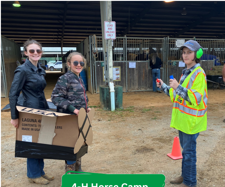
4-H Horse Camp