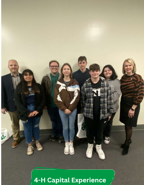
4-H Capital Experience