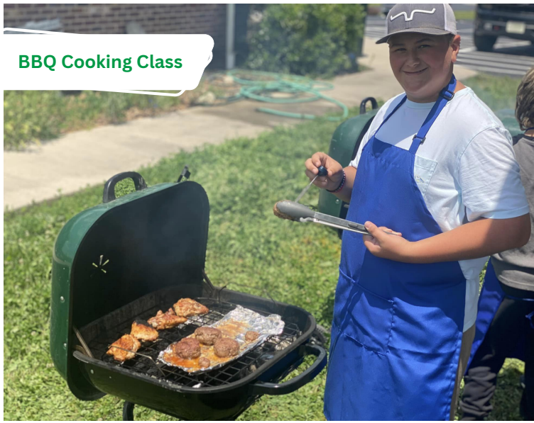
BBQ Cooking Class