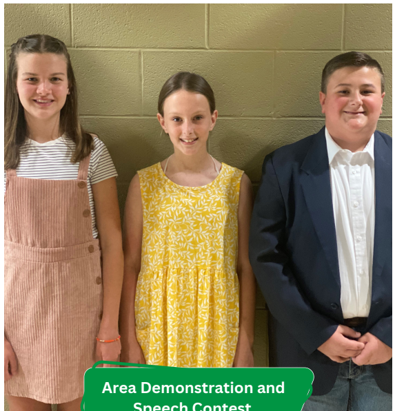
Area Demonstration and Speech Contest