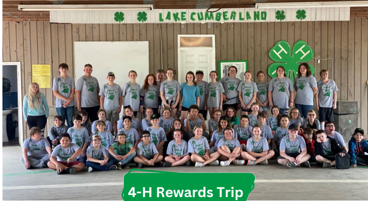
4-H Rewards Trip