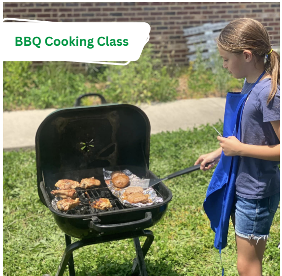
BBQ Cooking Class